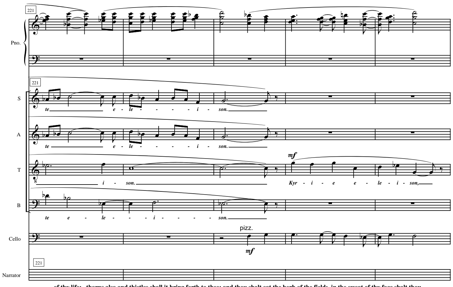
of thy life; thorns also and thistles shall it bring forth to thee; and thou shalt eat the herb of the field; in the sweat of thy face shalt thou