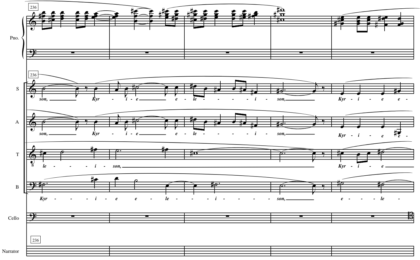
And Jehovah God said, Behold, the man is become as one of us, to know good and evil; and now, lest he put fouth his hand, and take also of the tree