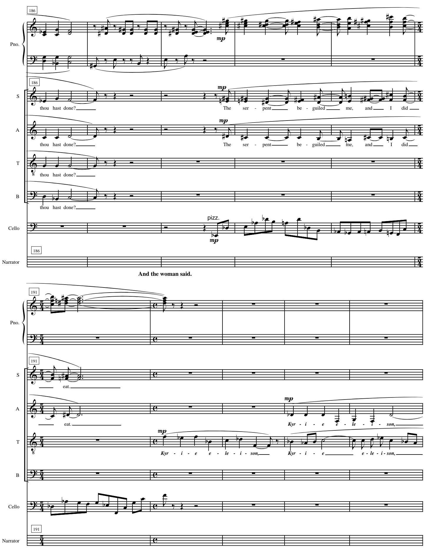
And Jehovah God said unto the serpent - Because thou hast done this,