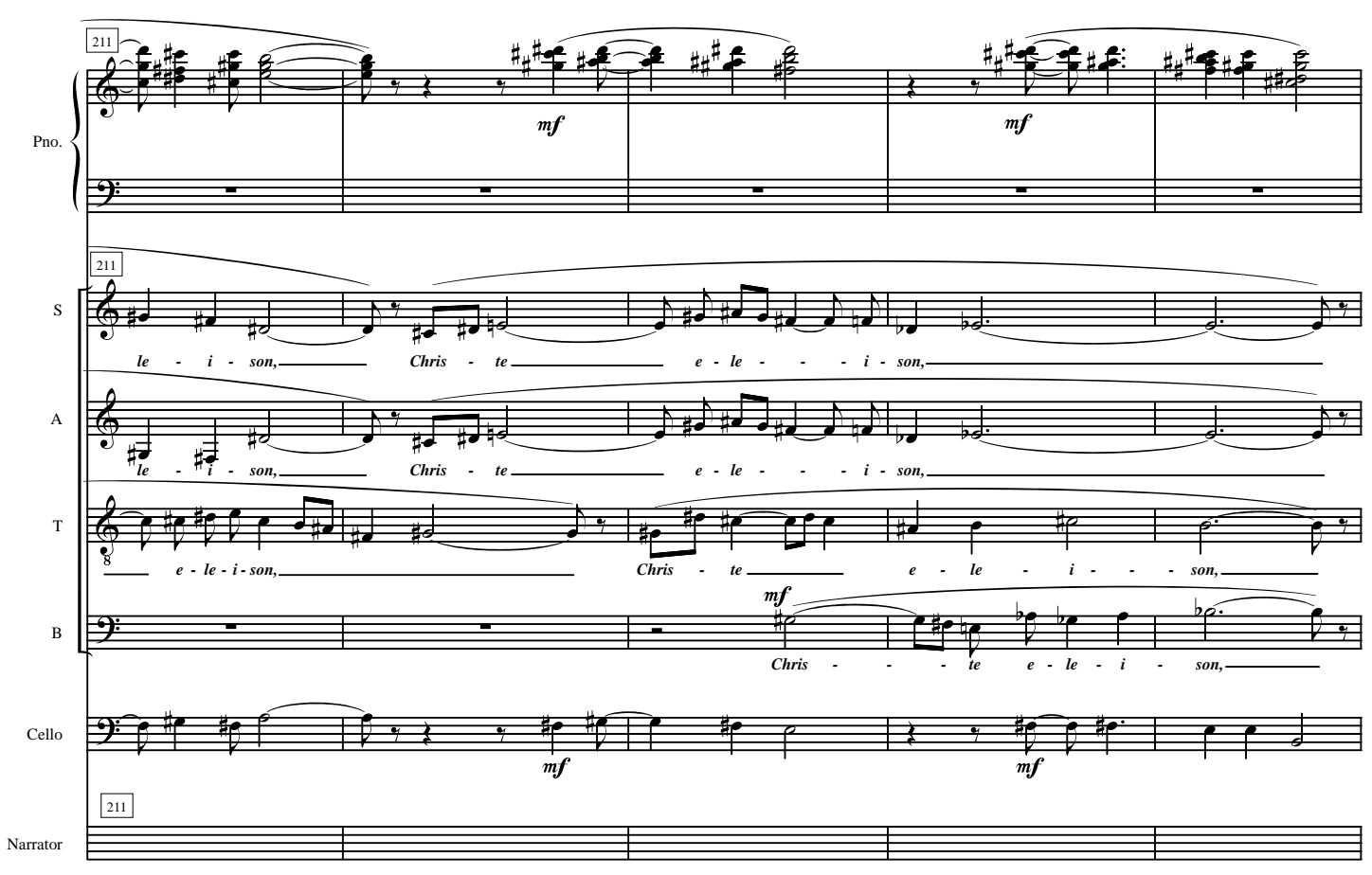
thy husband, and he shall rule over thee. And unto Adam he said - Because thou hast hearkened unto the voice of thy wife, and hast eaten of