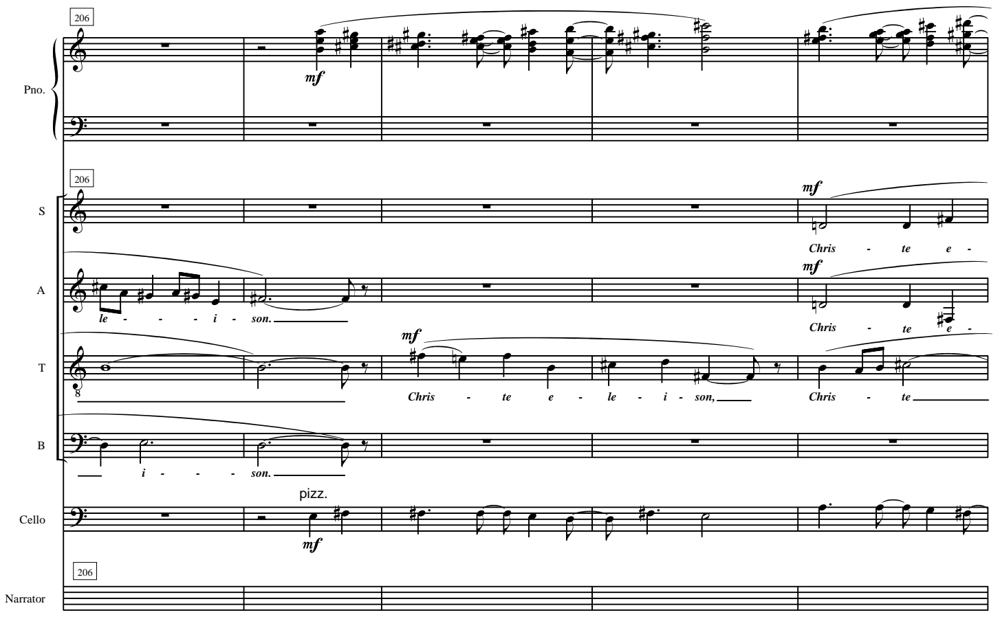
Unto the woman he said - I will greatly multiply thy pain and thy conception; in pain thou shalt bring forth children; and thy desire shall be to