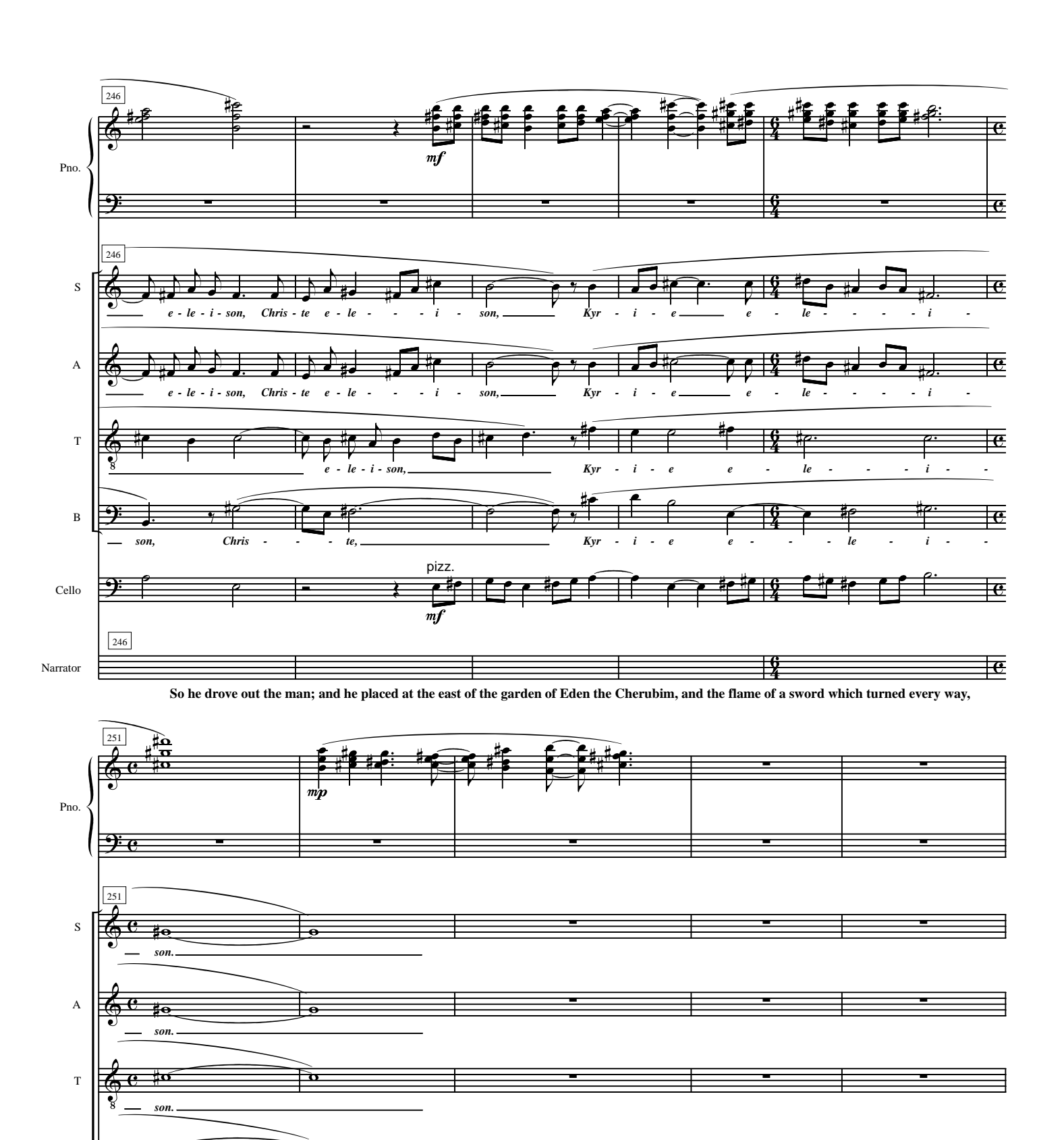
to keep the way of the tree of life.