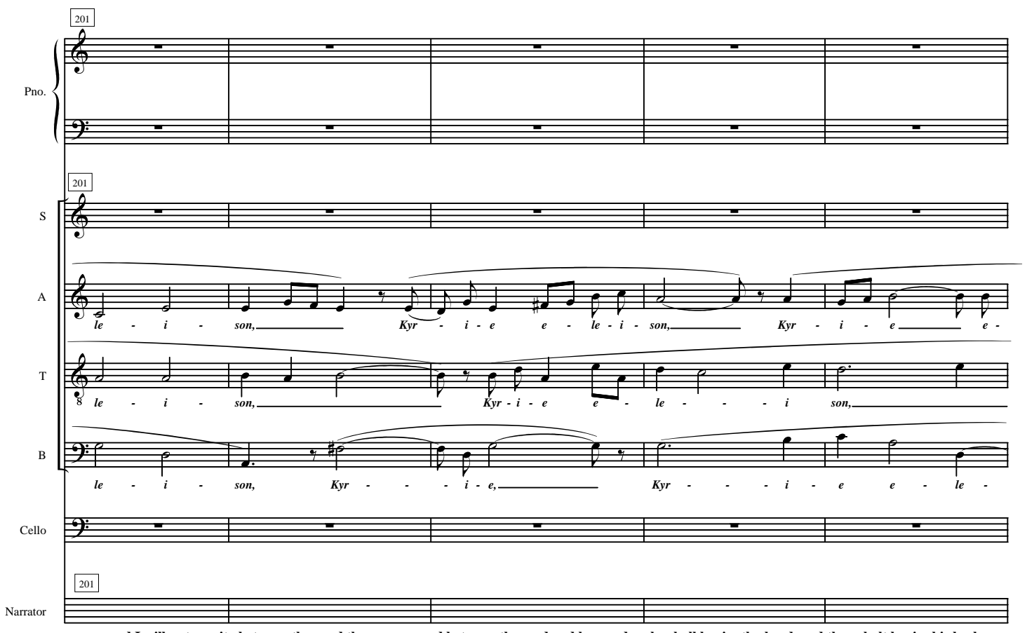
and I will put enmity between thee and the woman, and between thy seed and her seed: he shall bruise thy head, and thou shalt bruise his heel.